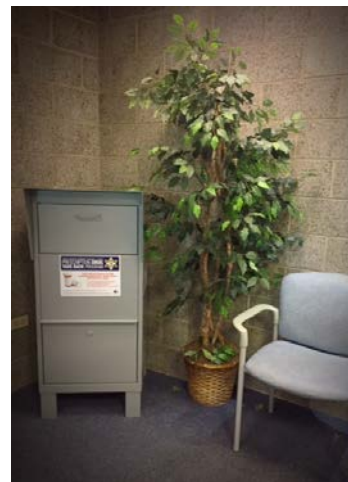
Above photo is of actual collection box inside the police departments waiting area

The Sheriff's Prescription Drug Take Back Program began assisting local towns and villages as well as Chicago wards by sponsoring Pharmaceutical Take-Back events. Today, the Sheriff's Prescription Drug Take Back Program also partners with the Metropolitan Water Reclamation District of Greater Chicago, which underwrites purchase of collection boxes for local jurisdictions and disposal of collected drugs.